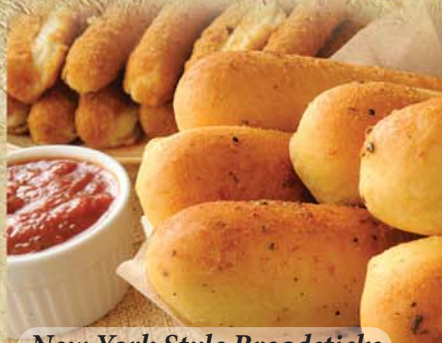
New York Style Breadsticks