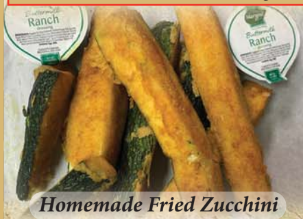
Homemade Fried Zucchini

New! Homemade Fried Zucchini Sm 5.99 Lg 9.99