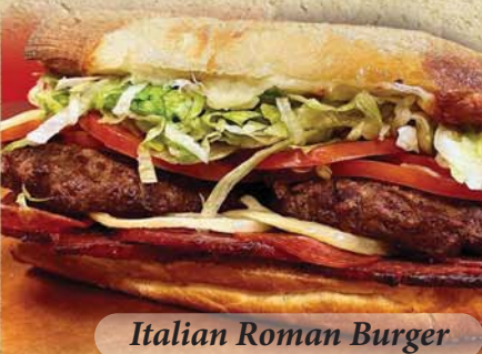
Italian Roman Burger