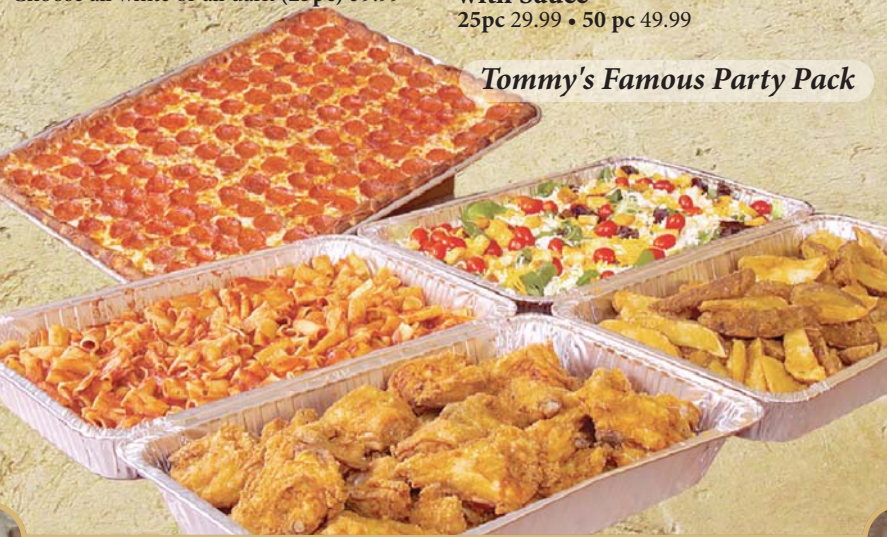
Tommy's Famous Party Pack

50 pc Chicken, 75 Jo-Jo Potatoes, 1-Topping Sheet Pizza, Full Pan Rigatoni & Full Pan of Salad $199.95 (salad dressing not included)