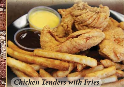
Chicken Tenders with Fries