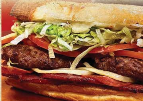
Italian Roman Burger