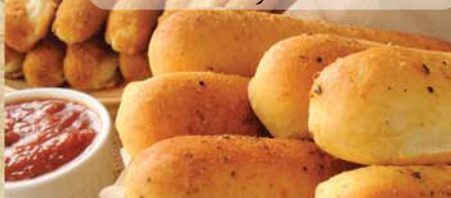
New York Style Breadsticks