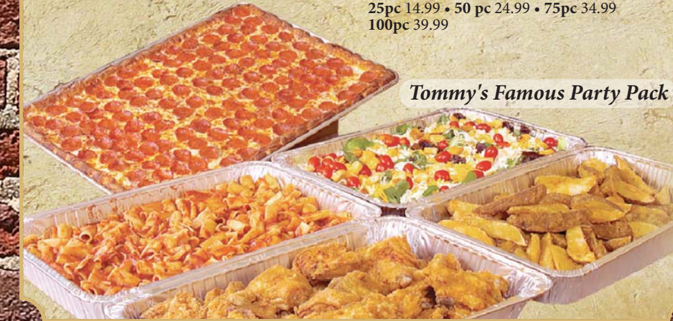
Tommy's Famous Party Pack