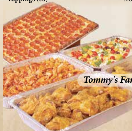
Tommy's Famous Party Pack