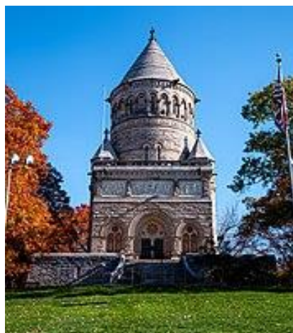
Garfield Memorial at Lake View Cemetery in Cleveland, Ohio

At the 1880 Republican National Convention, delegates chose Garfield, who had not sought the White House, as a compromise presidential nominee on the 36th ballot. In the 1880 presidential election, he conducted a low-key front porch campaign from "Lawnfield," his home in Lake County, and narrowly defeated the Democratic nominee, Winfield Scott Hancock. Garfield's accomplishments as president included his assertion of presidential authority against senatorial courtesy in executive appointments, a purge of corruption in the Post Office, and his appointment of a Supreme Court justice. He advocated for agricultural technology, an educated electorate, and civil rights for African Americans. He also proposed substantial civil service reforms, which were passed by Congress in 1883 as the Pendleton Civil Service Reform Act and signed into law by his successor, Chester A. Arthur.