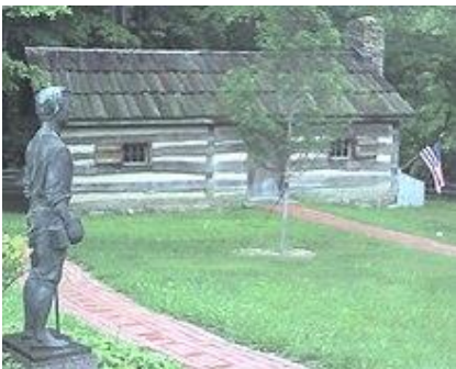
Replica of the log cabin in Moreland Hills, Ohio, where Garfield was born

James Abram Garfield (November 19, 1831 – September 19, 1881) was the 20 th president of the United States, serving from March 1881 until his assassination in September 1881. A lawyer and Civil War general, Garfield served nine terms in the United States House of Representatives and is the only sitting member of the House to be elected president. Before his candidacy for the presidency, he had been elected to the U.S. Senate by the Ohio General Assembly—a position he declined when he became president-elect.