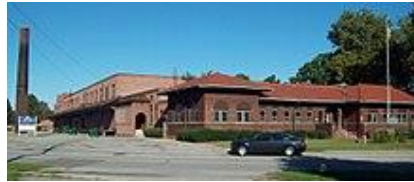
The original Jell-O Factory in Le Roy, New York, pictured in 2010

introduced: watermelon, blueberry, cranberry, margarita, and piña colada, among others.