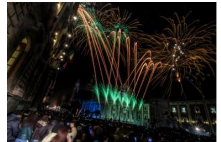
Bravery, faith, and fireworks: witness the breathtaking climax of the Feast of Sant'Agata!

The grand finale on the third day is nothing short of breathtaking. Once more, the statue graces the streets, but this time, a courageous display awaits at the steep Via San Giuliano. Here, bearers sprint up and down with the statue, a thrilling testimony of their bravery and unwavering faith in the saint. Imagine the crowd erupting in cheers, a unified show of faith and devotion.