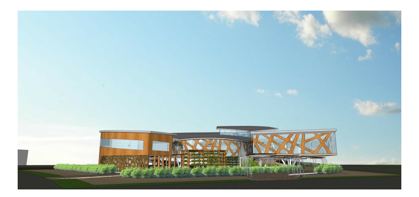
Photo 1: An aerial view of the conceptual design for the Expo 2020 Dubai Bahamas Pavilion with the theme, "One Country – The Islands Of The Bahamas."

Photo 2: An elevation of the conceptual design for the Expo 2020 Dubai Bahamas Pavilion with the theme, "One Country – The Islands Of The Bahamas."