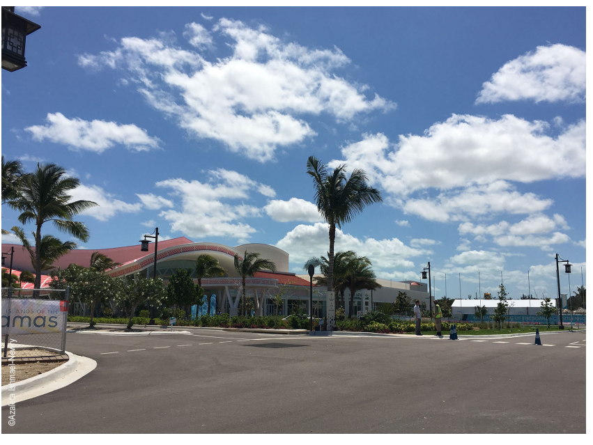
Set up of the conference show in photos above. The exterior of the Baha Mar Convention Centre is also shown