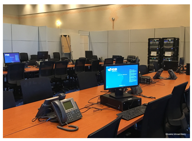
Media Room for Journalists and Writers