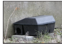
Typical bait boxes for rodents