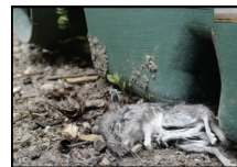
Poisoned rodents die outside the bait stations and become easy prey for wildlife and domestic pets