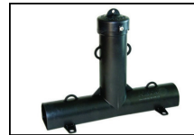
Vertical bait stations