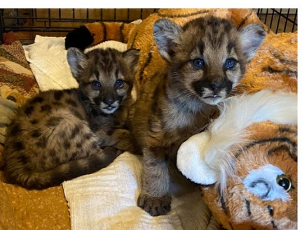
July 2020. Another Tragedy. Mom P-67 and Kittens P-91 and 92. P-67 was found dead and the kittens were orphaned. www.nps.gov/samo/learn/news/biologists-attempt-to-foster-orphaned-mountain-lion-kittens.htm:

"Reports of animal and human exposure to bromethalin increased following 2008 EPA mandates designed to decrease the use of SGARs like brodifacoum and bromadiolone, which are known to cause unintended secondary toxicosis in wildlife. The Pet Poison Helpline saw a 65% increase in bromethalin toxicosis cases reported between 2011 and 2014. The American Society for the Prevention of Cruelty to Animals said it received 2791 calls regarding exposure to bromethalin-based poisonings in 2015"