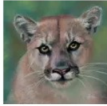
POISON FREE AGOURA IN AGOURA HILLS/COEXIST WITH URBAN WILDLIFE

HOME POISON FREE URBAN WILDLIFE WILDLIFE CROSSING