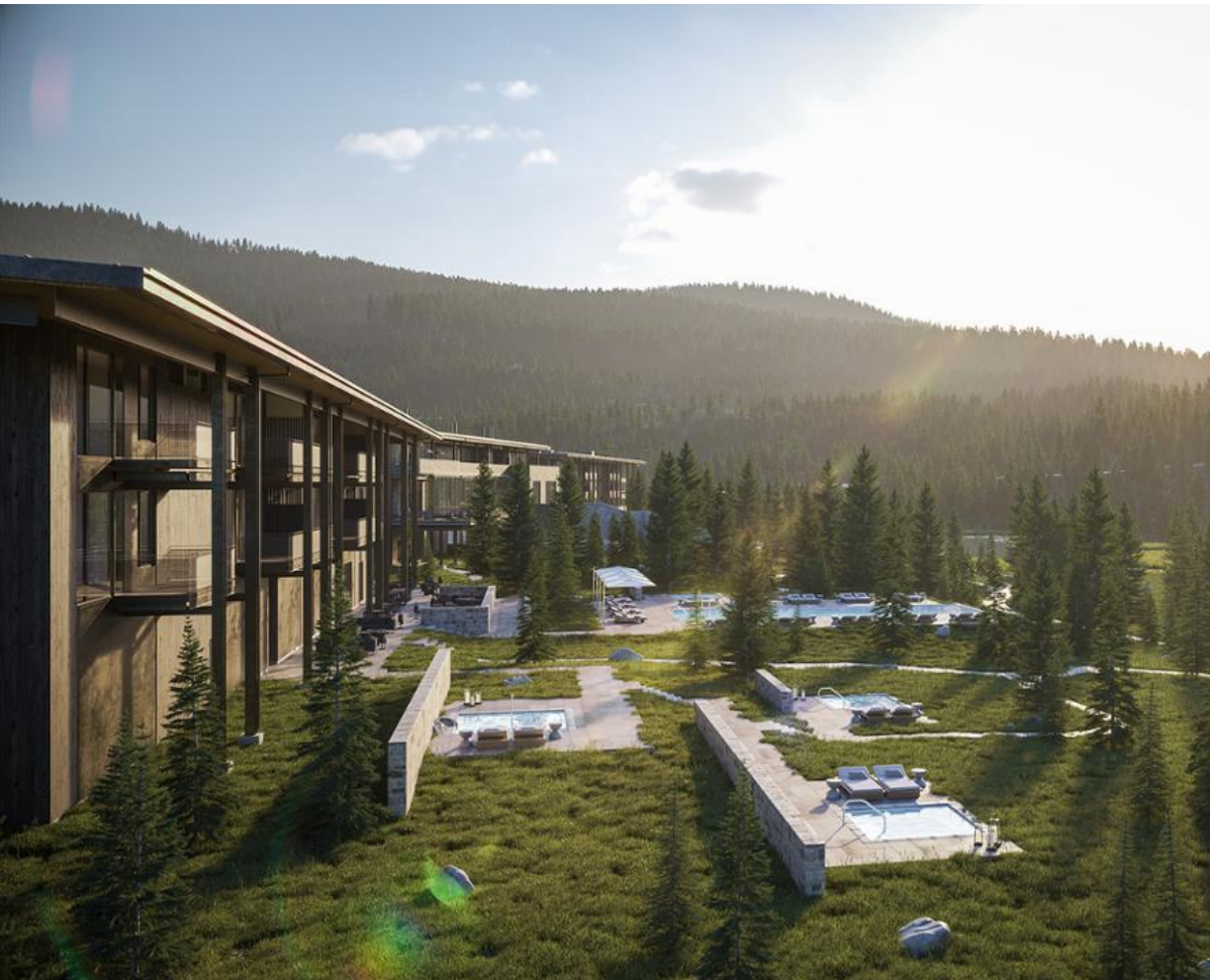
Artist impression only