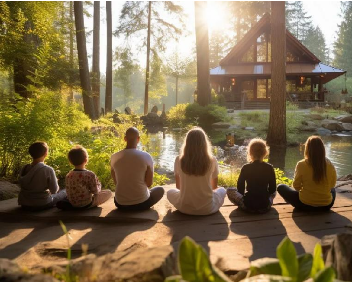
Artist impression only