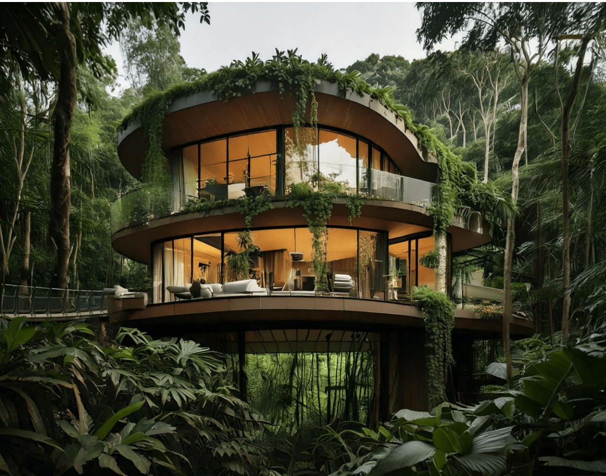
Artist impression only