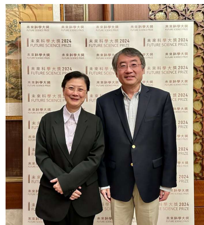
2024 FSPE Media Lunch on 23 July 2024

The 2024 Future Science Prize Event comprised a Science Popularization Series, an Exhibition, and the 2024 Future Science Prize Week.