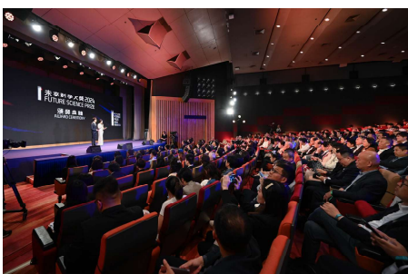
Award Ceremony on 3 November 2024