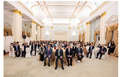
Welcome Dinner on 1 November 2024 at the Hong Kong Government House

The 2024 Future Science Prize Week included a series of world-class scientific events, such as the Science and Technology Forum at the Hong Kong University of Science and Technology, the Asian Young Scientist Fellowship Annual Conference at the University of Hong Kong, a Welcome Dinner at the Hong Kong Government House, a two-day Science Symposium, and a Laureates' Dialogue with the Youth at the Hong Kong Science Museum, culminating in an Award Ceremony at the Hong Kong Convention and Exhibition Centre.