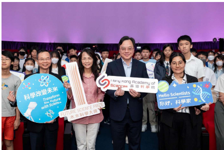
Science Popularization Lecture by Dennis LO on 30 July 2024