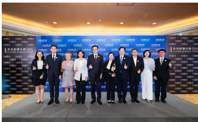
2024 FSP Press Conference on 16 August 2024