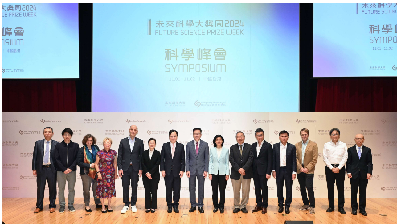
Opening Ceremony of 2024 Future Science Prize Week on 1 November 2024