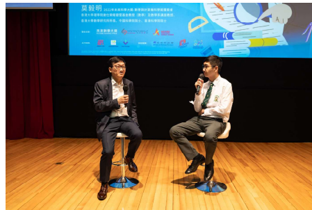
Science Popularization Lecture by Ngaiming MOK on 10 August 2024