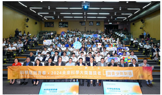
Laureate Dialogue with Youth on 3 November 2024