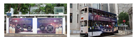
Advertisement for 2024 Future Science Prize Week