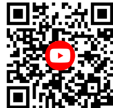
ASHK Youtube Channel