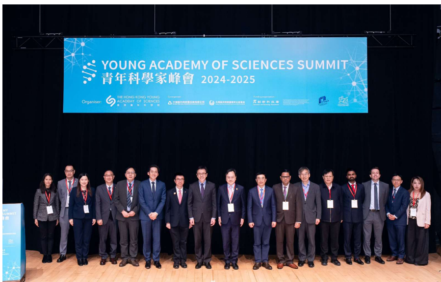
The 2nd Young Academy of Sciences Summit on 13 December 2024.