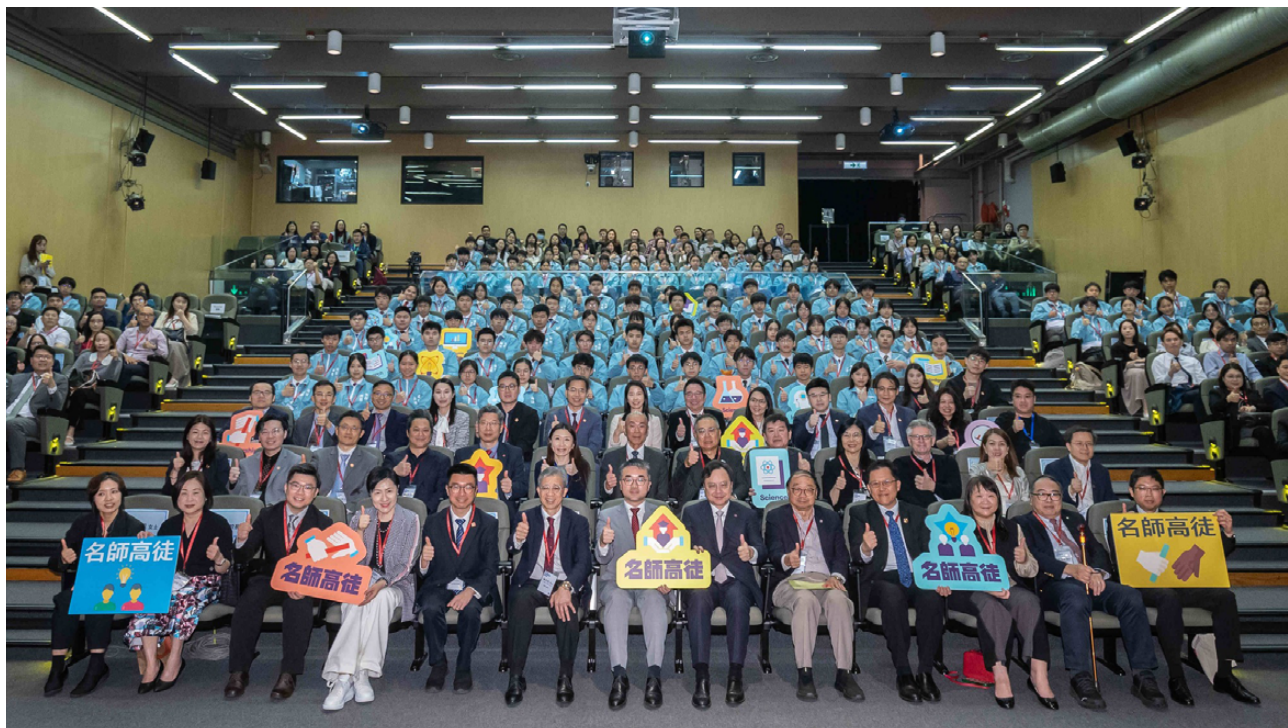
The DMAS Mentorship Programme Kick-off Ceremony on 22 March 2026.