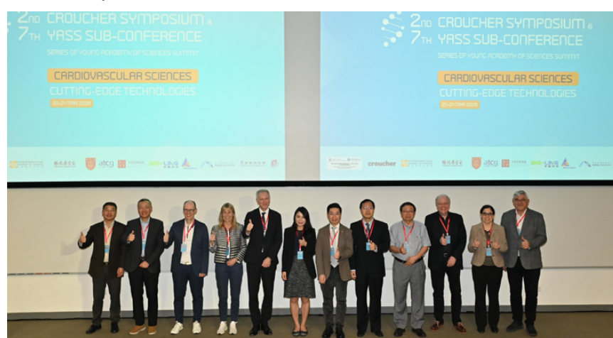
The 7th Sub-Conference of the Young Academy of Sciences Summit on 20 & 21 March 2026.