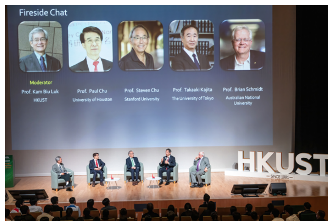
IAS Nobel Symposium on 6 February 2026