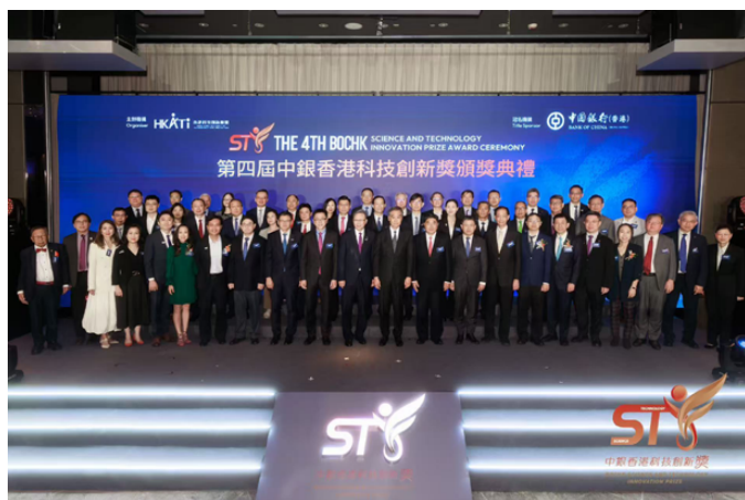
The 4th BOCHK Science and Technology Innovation Prize Award Ceremony on 22 May 2026.