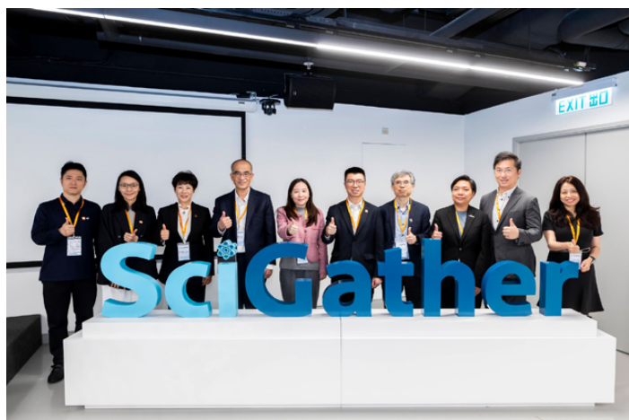
SciGather on 24 April 2026

A key highlight of the event was the panel discussion titled "Talent, Industry, Future: Nurturing and Retaining I&T Talent in Hong Kong." The session brought together distinguished experts to explore the critical challenges and strategies for building a robust talent ecosystem in Hong Kong, facilitating a high-level dialogue between the research community and industry leaders.