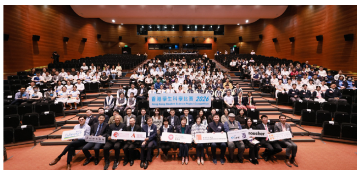
Hong Kong Student Science Project Competition 2026.