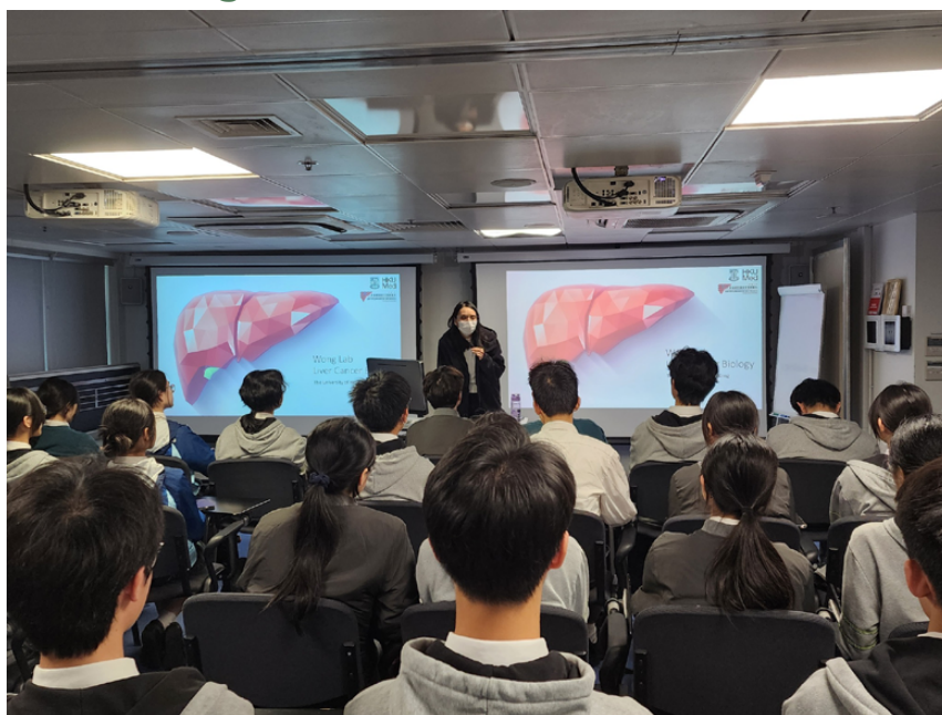
Lab Visit at Cancer Biology Lab