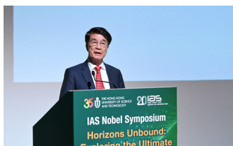
Paul C. W. CHU was invited to deliver the talk on “The Genesis of HKUST IAS 20 Years Ago & The Never-Ending Frontier of Advancing Record High T c ”.