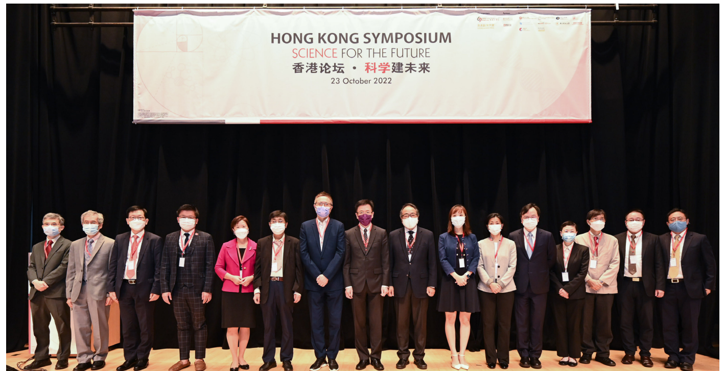
Hong Kong Symposium showcased and promoted Hong Kong's strength and influence as a global innovation and technology centre in the Guangdong-Hong Kong-Macao Greater Bay Area.