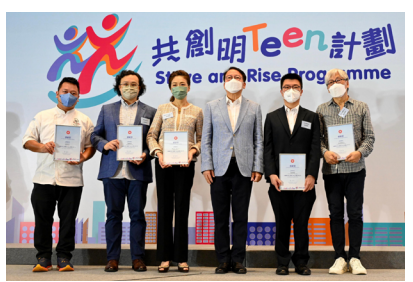
Strive and Rise Programme Kick-Off Ceremony.