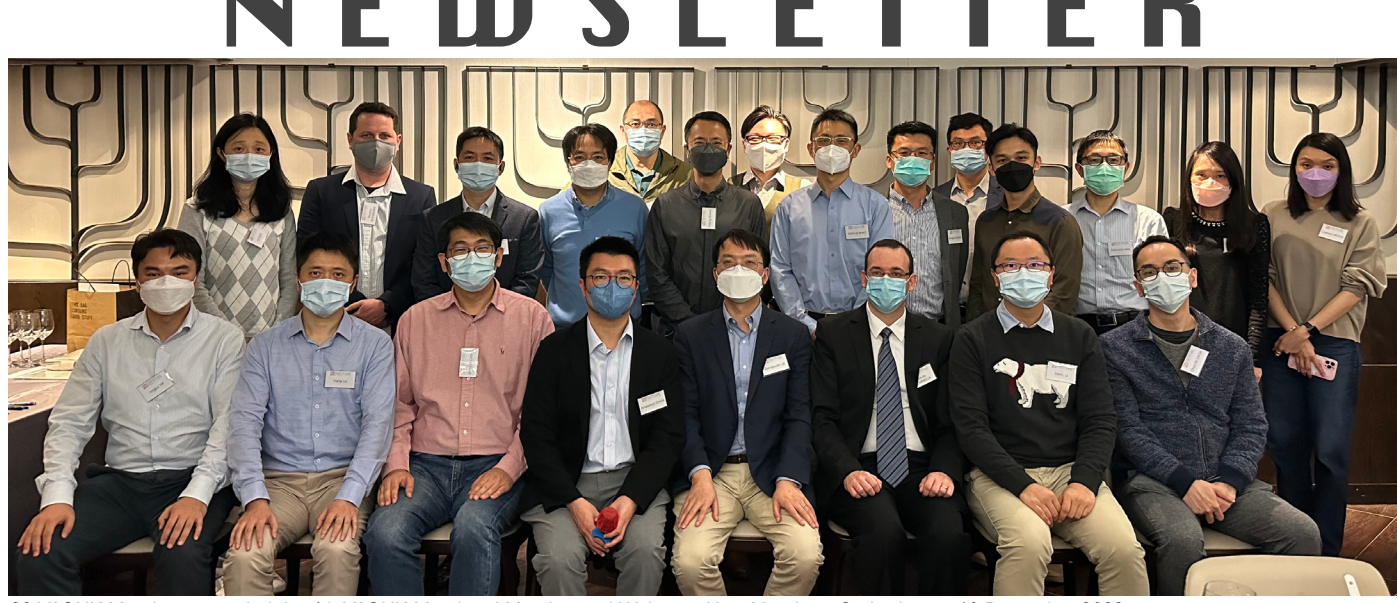
23 YASHK Members attended the 4th YASHK Members' Meeting and Welcome New Members Gathering on 10 December 2022.