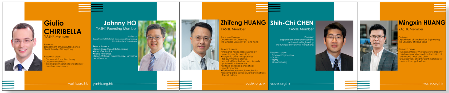
Introduction of YASHK Members in YASHK Facebook and Instagram.

In order to raise public awareness of YASHK Members, one Member's introduction post has been released on YASHK Facebook and Instagram each week since September 2022.