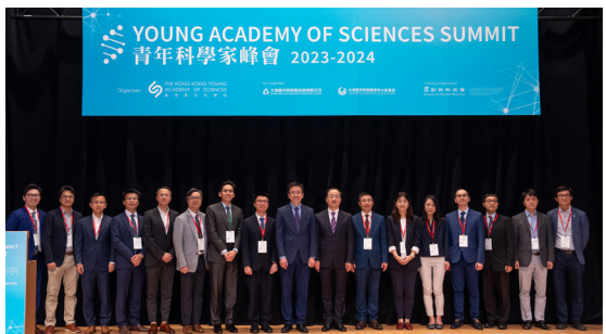
Over 12 YASHK Members attended the 1st Summit of YASS.