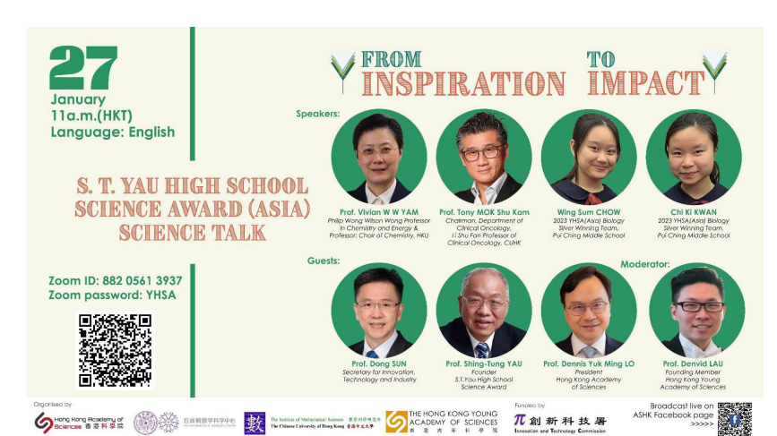
YHSA(Asia) 2023 online Science Talk: From Inspiration to Impact on 27 January 2024.