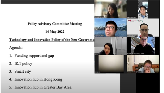
The first Policy Advisory Committee Meeting was held on 14 May 2022.

Each Sub-Committee is co-chaired by one Executive Committee Member and one Non-Executive Committee Member: