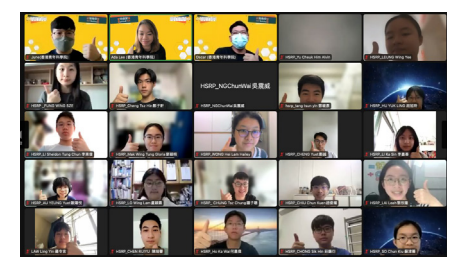
HSRP 2023 Online Briefing Session on 6 May.