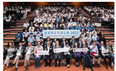
HKSSPC 2023 Award Ceremony on 23 April 2023.