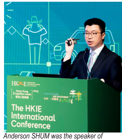
HKIE International Conference.