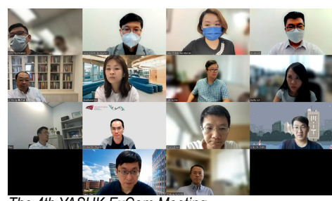
The 4th YASHK ExCom Meeting.