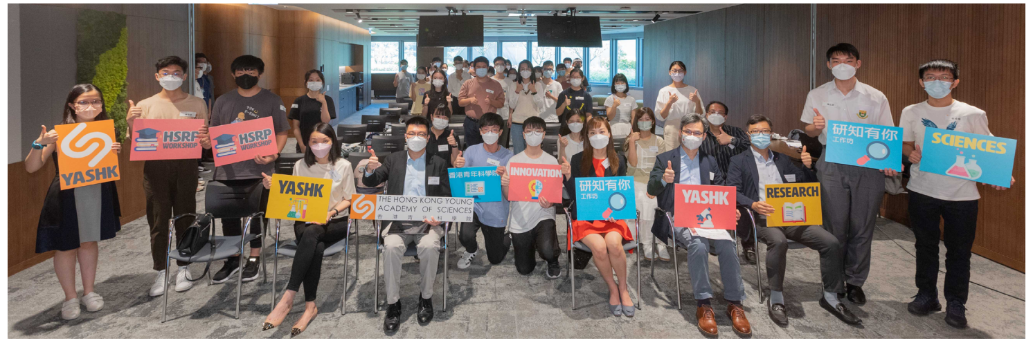
40 HSRP Students participated in the HSRP Graduation Ceremony and "Nurturing Scientific Research Talents in Hong Kong" Forum on 3 September 2022.