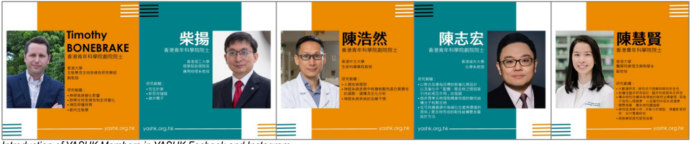
Introduction of YASHK Members in YASHK Facbook and Instagram.