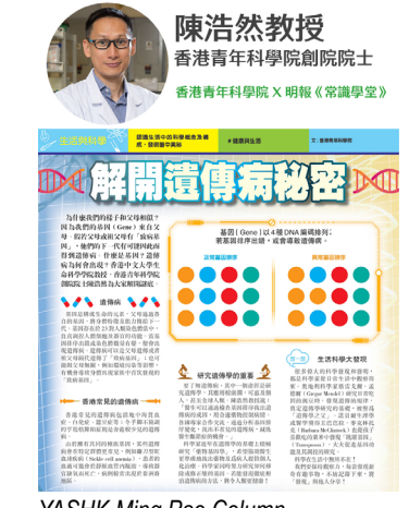
YASHK Ming Pao Column.

In order to raise the public awareness of YASHK Members, the YASHK Secretariat is preparing a brief induction for each Member. One Member's introduction post is being released on YASHK Facebook and Instagram weekly since 1 September 2022.