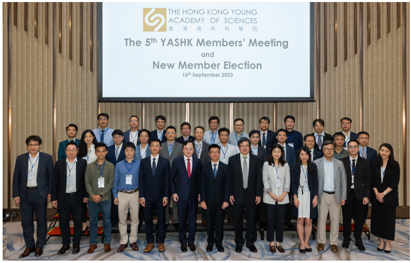
The 5th YASHK Members' Meeting and New Member Election on 16 September 2023.