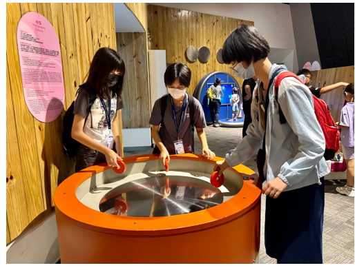
Macao I&T Tour for Hong Kong students on 29 August 2023.