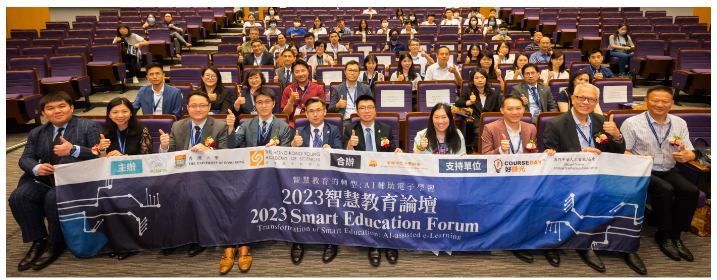
2023 SMART Education Forum on 24 August 2023.

YASHK, in collaboration with the Macao Joint School Science Exhibition Youth Association, The University of Hong Kong, The Association of Hong Kong Chinese Middle School, and The Macau Chinese Association for Artificial Intelligence, organized a forum on 24 August 2023. The forum, titled "2023 Smart Education Forum: Intelligent Transformation - Al Assisted E-Learning," aimed to promote the integration of Al into traditional teaching methods. The forum comprised Principals of Secondary Schools from Hong Kong, Macau, and other distinguished professors, creating a unique opportunity for networking and collaboration among like-minded individuals.