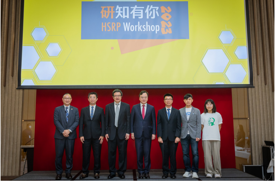
2023 HSRP Graduation Ceremony on 16 September 2023.