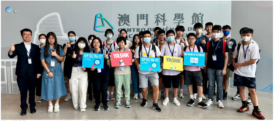
30 HSRP mentees visit Macao Science Center.