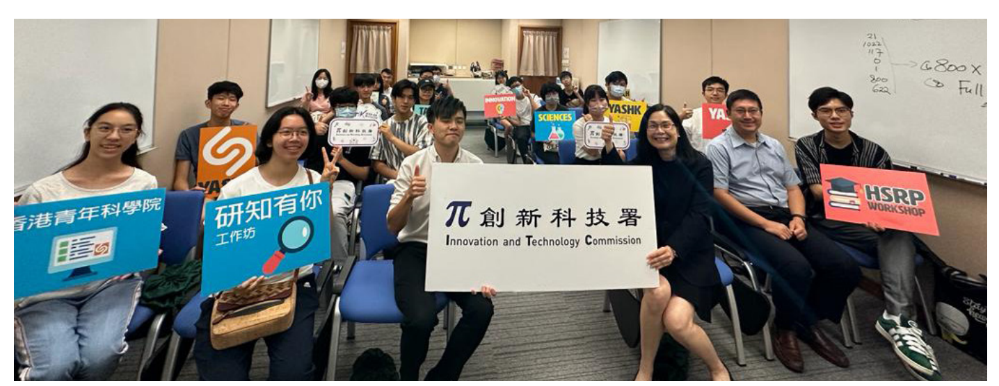
SCL visit on 17 August 2023.

28 mentees from the HSRP Workshop participated the Standard and Calibration Laboratory of the Innovation and Technology Commission visit on 17 August 2023, to understand the calibration services and measurement standards, such as Temperature, Photometry & Radiometry, Length and Mass and more.