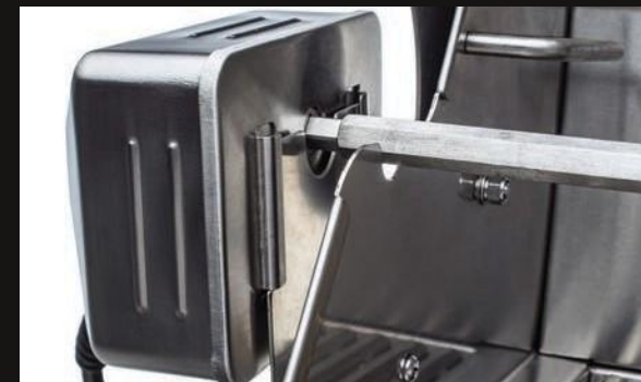
Rotisserie Kit Included rotisserie kit with waterproof motor provides grilling versatility.