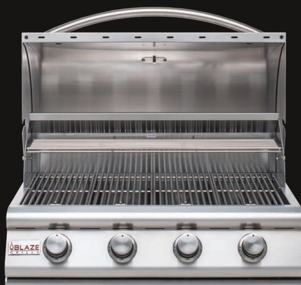
BLZ-4LBM-NG/LP OPTIONAL CART: BLZ-4-CART