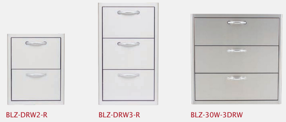
BLZ-DRW2-R BLZ-DRW3-R BLZ-30W-3DRW

Available in 30" extra-wide triple access drawer and 16" single/double/triple access drawer models. Blaze sliding drawers feature an easy-close assist mechanism that closes drawers with a soft touch.