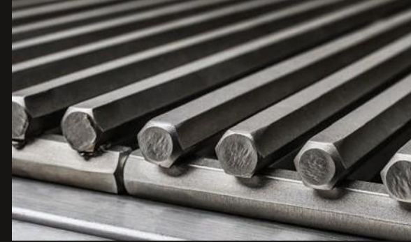
Heavy-Duty Hexagonal Cooking Rods 12mm thick cooking rods absorb heat, producing deep sear marks.