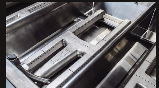
Heat Zone Separators Removeable heat zone separators divide cooking surface into individual temperature zones putting you in command of every inch of cooking.