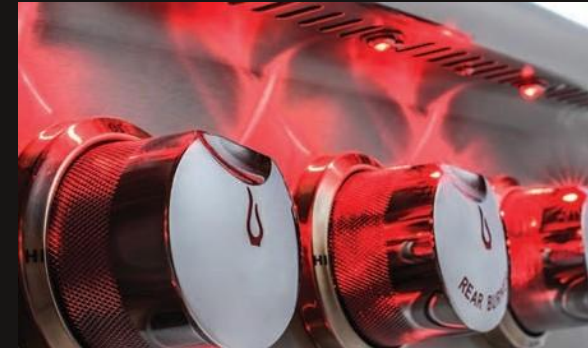
Illuminated Control Knobs Sophisticated red LED lights illuminate and accent the control knobs.