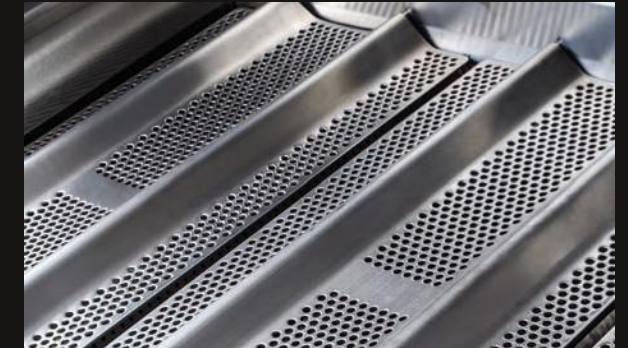
Perforated Flame Stabilizing Grids Heavy-duty 12mm flame stabilizing grids cover the entire grill to maximize flavor and minimize flare-ups.