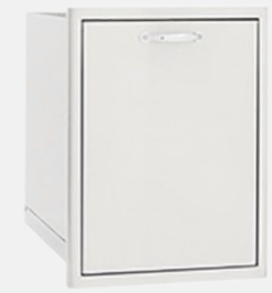
Double Trash/Recycle Drawer BLZ-TREC-DRW