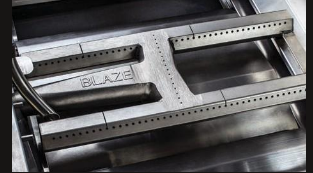
Cast Stainless Steel Burners Professional-quality, cast stainless steel H-burners deliver impressive cooking power and durability.