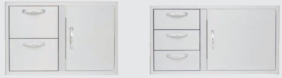
32": BLZ-DDC-R 39": BLZ-DDC-39-R