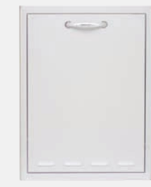
18 Inch Single Trash /Propane Drawer BLZ-TRLP-DRW

Available in 32" and 39" models. Blaze sliding drawers feature an easy-close assist mechanism that closes drawers with a soft touch.