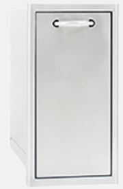
Narrow Trash Storage Unit BLZ-TRNW-DRW