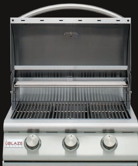
BLZ-3LBM-NG/LP OPTIONAL CART: BLZ-3-CART