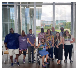
The whole group!