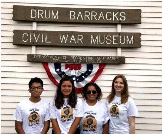
Civil War Tech Squad volunteers stand ready to greet visitors

As this issue goes to press we are still recovering from our second, highly successful, Civil War Technology Fair. We would like to thank all our volunteers, exhibitors and lecturers for their time, talent and passion for sharing history with the public.