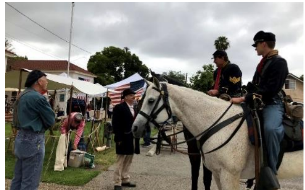
Mounted cavalry from On Site Living History joined our 2019 event

Enjoy the rest of these lazy summer days, because fall is going to be amazing. The months from September to December are our busiest in terms of community events, and this year we will add another very important event to our schedule, the LA as Subject Archives Bazaar, held at USC. This event, featuring museums, archives, historical societies and libraries, is a wonderful opportunity for us to promote our Research Library and introduce Drum Barracks Museum to a whole new segment of Los Angeles history buffs. Our Research Library is available for use by appointment with more than 5,000 books and periodicals on all aspects of Civil War life, politics and society. Members have borrowing privileges so make an appointment and take advantage of all the library has to offer. For dates and information on all of our fall events check our website www.drumbarracks.org or follow us on Facebook and Instagram.