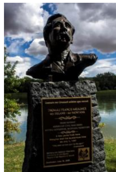
General Thomas Francis Meagher Memorial, Fort Benton, Montana

Meagher's willingness to endanger his own life for Ireland's independence and the American Civil War gives proof of his patriotism. His dark ambition to gain arms and retaliate against the Native American Indians is evidence of a cowboy who sought the popular support of white settlers in the Wild West Territory of Montana. The mysteries that surround Meagher contribute to his commemoration and highlight a now-historical figure's life. Meagher's commemoration is not only a symbol of Meagher himself, but rather a symbol of all Irish-Americans, bringing into focus the important contributions the Irish had in the formation of the United States of America. His intentions remain a mystery, but his ambitions are abundantly apparent, and to this day, Meagher remains a symbol of Irish-American pride in the great state of Montana.