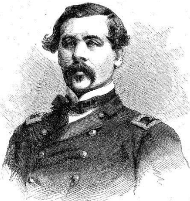
THOMAS FRANCIS MEAGHER.

After the war, Meagher was appointed secretary of the new Territory of Montana, which had been created in May 1864. On Aug. 16, 1865, Meagher set out from Salt Lake City to Virginia City and arrived in Montana Territory on Sept. 19, 1865. Shortly after his arrival, he was designated acting governor, as Territorial Governor Sidney Edgerton, now known as "The Father of Montana," departed for Washington, D.C., in September to persuade Congress to allocate funds for the new territory. Edgerton handed Meagher all of the territorial documents, and would not return to Montana for 25 years. In Virginia City, the capital of the new territory, Meagher began to understand the complexities of the conflicting needs and interests of Native Americans, traders, cowboys, immigrants and settlers. Meagher knew very little about the layout of the land between the white settlers and the Native Americans.