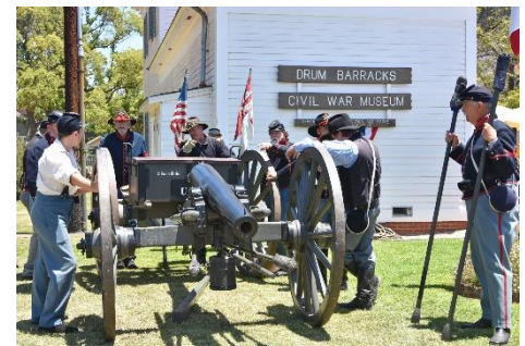
Members of the First Pennsylvania Light Artillery, Battery B, reposition their cannon in front of Drum Barracks.

A major highlight of the day came when the First Pennsylvania Light Artillery, Battery B, performed a cannon demonstration in the lot north of the museum. Months of preparation were required to get permission for the cannon demonstration. There were advance communications with the Police Department, a site inspection by the Fire Department, permits, insurance, and passing out notices to neighbors, but it all paid off at 2:00 pm when we covered our ears and the First Pennsylvania fired off three black powder rounds. One visitor described it as "epic" to see Civil War technology in action.