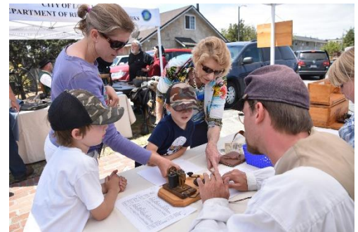
Young visitors explore telegraph communications at the Civil War Technology Fair.

It can be daunting when you launch a new program, but my anxieties about the Technology Fair quickly faded as the grounds filled with reenactors and exhibitors eager to share their knowledge of Civil War firearms, medicine, communications, photography and transportation (by land, air and sea).