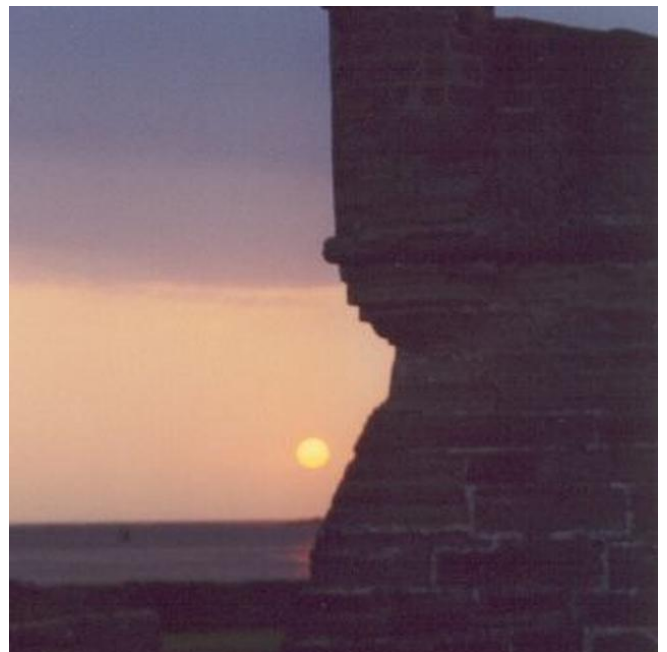
Completed in 1672, Castillo de San Marcos symbolizes the Spanish heritage of St. Augustine, Florida, the first permanent European settlement in the continental United States.

People of Spanish heritage established roots in North America centuries before the Civil War. Following the arrival of Columbus in 1492, many explorers rushed to claim the "New World" for Spain, including the mainland of North America. As early as 1526, Spanish settlers attempted to colonize the shores of what is now South Carolina. This effort failed, but in 1565 Spain established St. Augustine, Florida, the first permanent European settlement in the present-day United States. Other explorers pushed inland. In 1539, Hernando de Soto landed on the coast of Florida and began a winding journey that would carry him across the Mississippi River. In 1540, Francisco Vásquez de Coronado marched from Mexico to explore much of the land that comprises the modern US Southwest. Two years later, Juan Rodríguez Cabrillo set foot on California's coast. This push north- and westward continued with the establishment of trading posts, missions, colonies, and towns. By the 1700s, Spain claimed ownership of much of the continent. On July 4, 1776, while the American colonies in the East boldly declared independence from Britain, the Spanish were celebrating the founding of San Francisco on the other side of the continent.