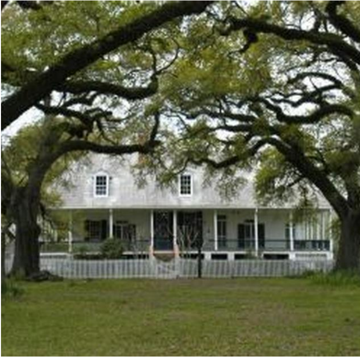
Descendants of Spanish explorers and settlers made their homes along the bayous, in large plantations, and in the port cities of the Gulf Coast.

Confederate Gen. Robert E. Lee and fought at battles such as Antietam and Gettysburg.