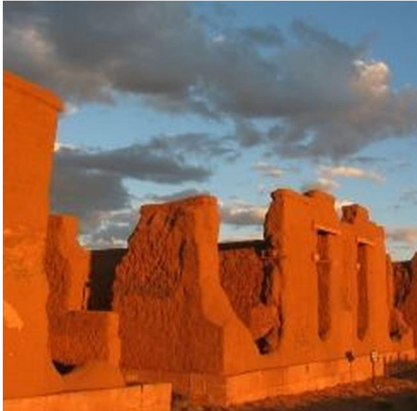
Fort Union National Monument National Park Service, Fort Union National Monument

For many Americans the Civil War evokes images of the storied battlefields of North and South and of dramatic changes in the lives of Americans of African and Anglo descent. Lesser known is the story of the people of Spanish ancestry who participated in this epic conflict and of the many battles that took place in the West, in areas of large Hispanic populations and strong Spanish heritage.