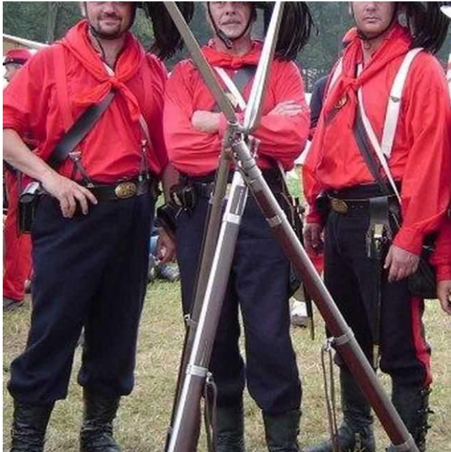
Recognized by their European-style uniforms, living historians portray the "Garibaldi Guard" which included a company of Spanish and Portuguese soldiers.

and Boston. In addition to large populations of Germans, Irish, and Eastern Europeans, these cities attracted immigrants from Spain, Portugal, Cuba, Puerto Rico, and Mexico. Many of these newcomers sought to integrate themselves into the