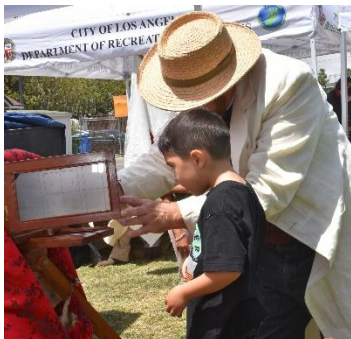
Bailey-Denton Photography teaches visitors about 19 th century cameras.