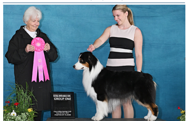
Five Valley Kennel Club (FVKC) - Missoula, MT, May 30 - June 2, 2024