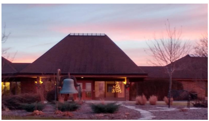
United Church of Christ - Wisconsin Headquarters is the site used for our State Board meetings.

Go to: https://churchwomenunited-wi.org/