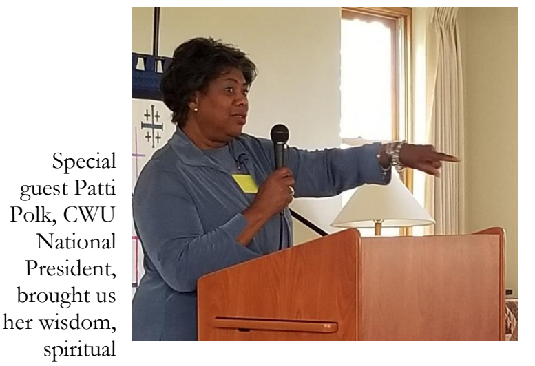
strength, warmth and encouragement. She led the Memorial Roll Call and spoke on "Finding Spiritual Time in a Busy World."