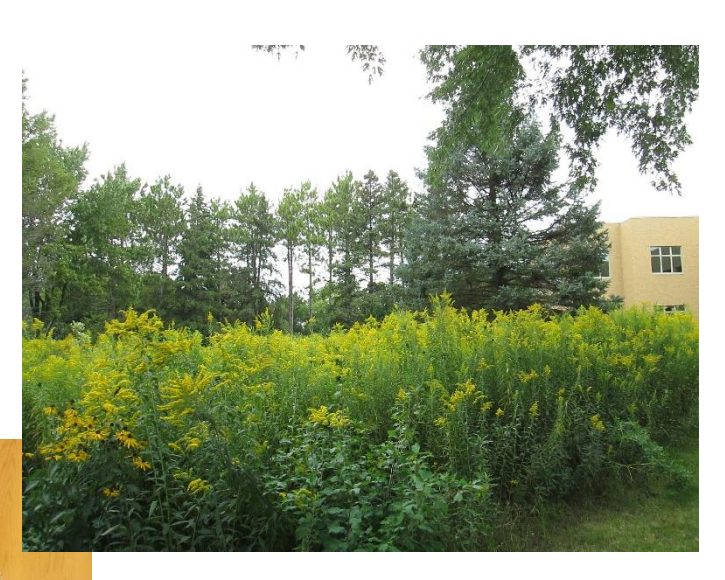
A native prairie garden along the walk to the monastery building