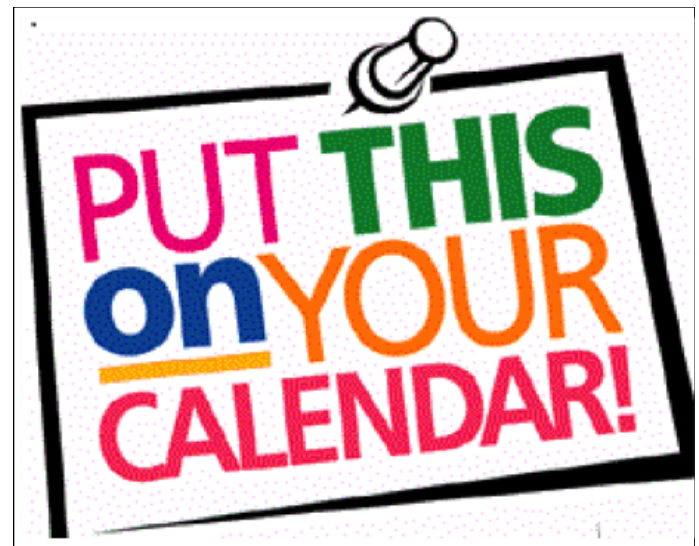
Annual Meeting Reminder

On Saturday, November 4th, 2023 is the annual meeting and election day for your Woodbound Home Owners Association. At the annual meeting the floor will be open for nominations. The HOA mailed a ballot and a proxy in the mail to all home owners. If attending meeting please bring along your voting ballot. If you are not able to attend the meeting you may mail your ballot so it will be received no later than 30 October 2023. Your other option is to provide your proxy to