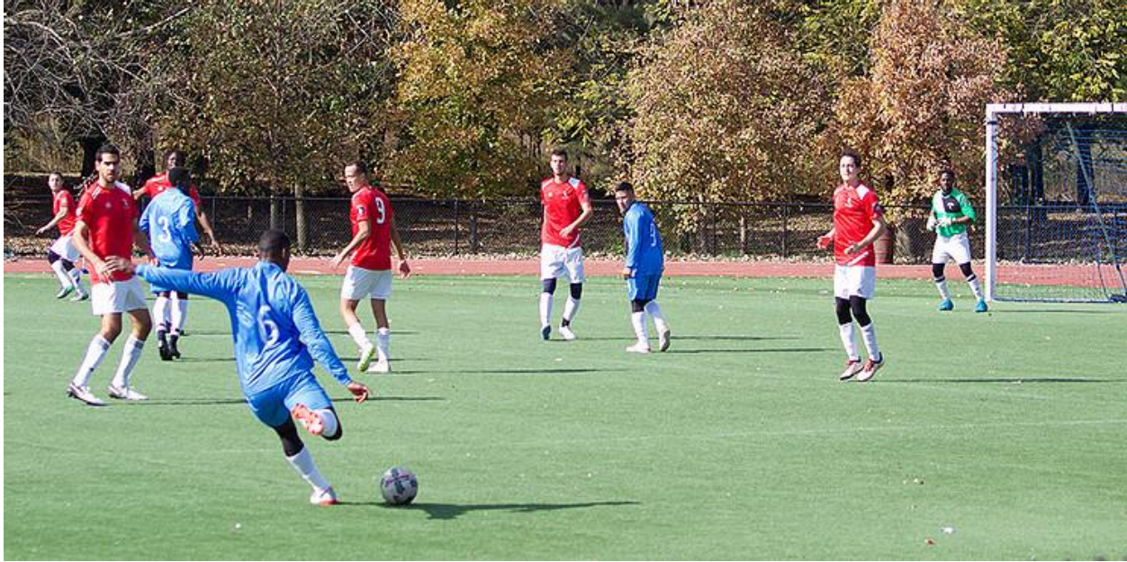
Game pic of Sporting SC's match versus NY Athletic Club.

It was a tough one to swallow for the new man in charge, Mansfield.