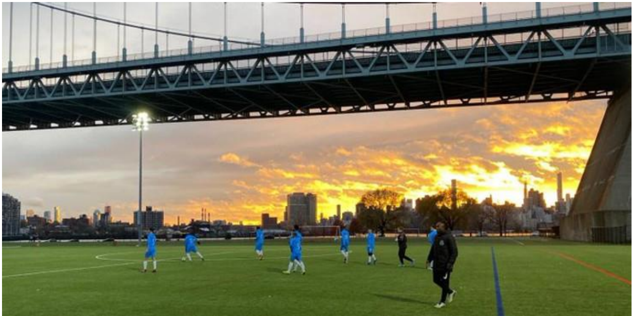
Sporting SC players before a game at Randall's Island.

November wasn't the best month but it seems like Sporting S.C. is starting to turn things around with their new squad as they went 1-1-1.