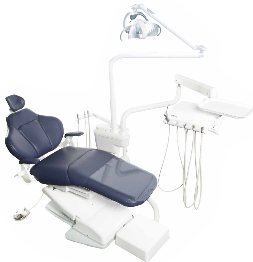
E300 Chair Shown with Summit Stitch Upholstery