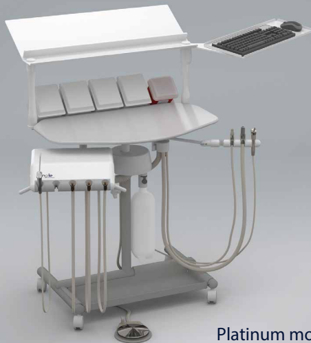
Platinum model #P050320

The ultimate flexibility, move and position your delivery and storage where and when you need it. Engle's Dual Doctor & Assistant cart features full left/right functionality with all the great features and options of our chair mounted delivery systems.