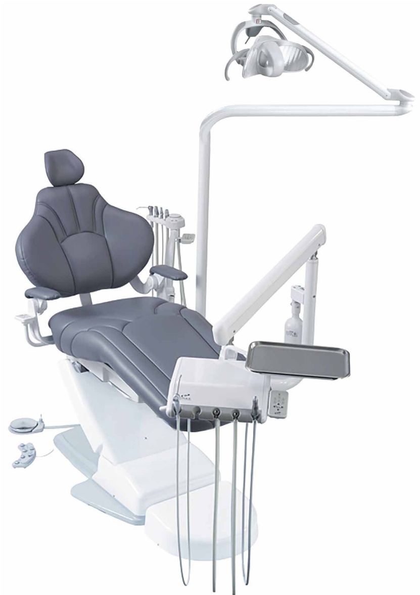
Wide Back E300 Chair Shown with upgraded Twin Stitch, Ultraleather Upholstery

Std 360 Package: MSRP $21,425.45 Traverse 360 Package: MSRP $23,725.45 as shown with upgrades: MSRP $27,299.00