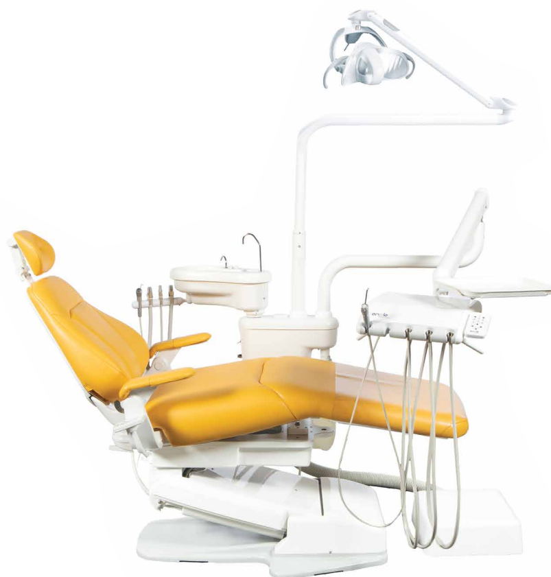
E300T Traverse Chair Shown with Summit Stitch Upholstery