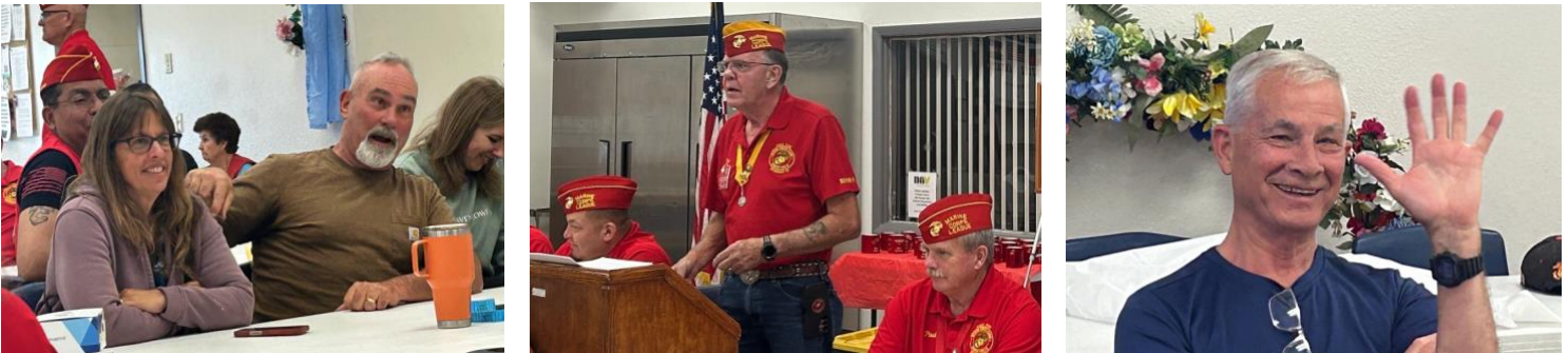
May 2026 Pikes Peak Detachment Monthly meeting.