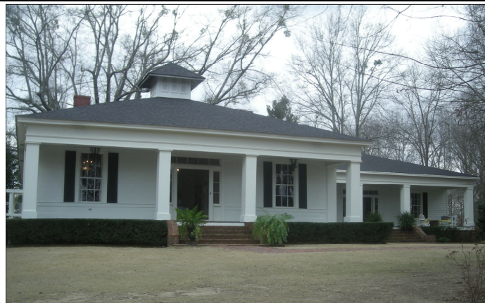
Water Oak Manor