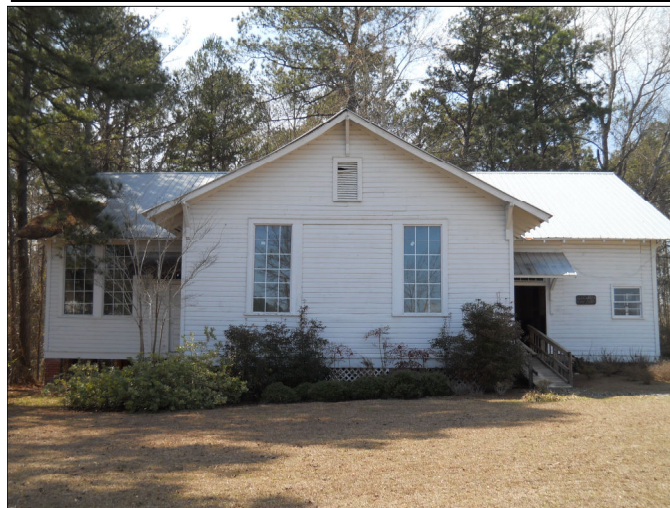
Farmville Community Center—Botsford School