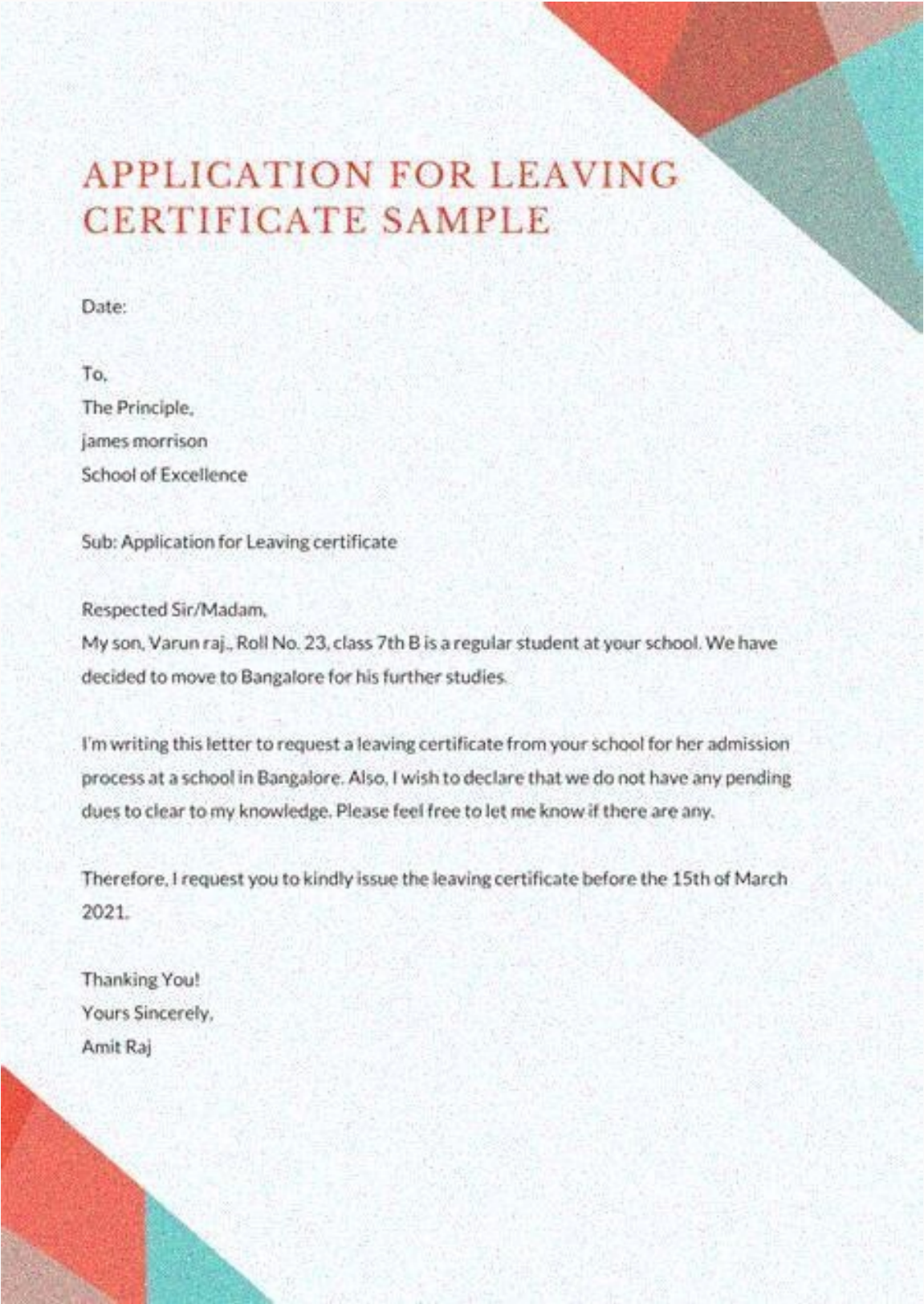
Application to get leaving certificate from college.

A school leaving certificate is a document proof that is issued by the academic institution where the student was enrolled in a course.