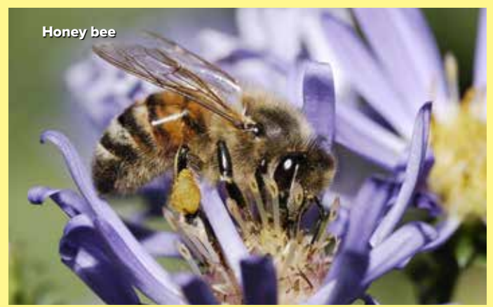
Honey bees are native to Europe and were introduced to North America, but are important pollinators.

be a danger to people, try to leave the nests alone and avoid disturbing them. Sometimes nests such as beehives do need to be moved, but this should only be done by a professional! By learning how to recognize the different types, you will be better able to deal with them.