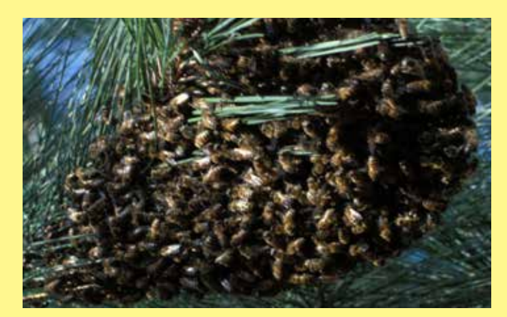
Many bees are social, as seen in this honey bee swarm.