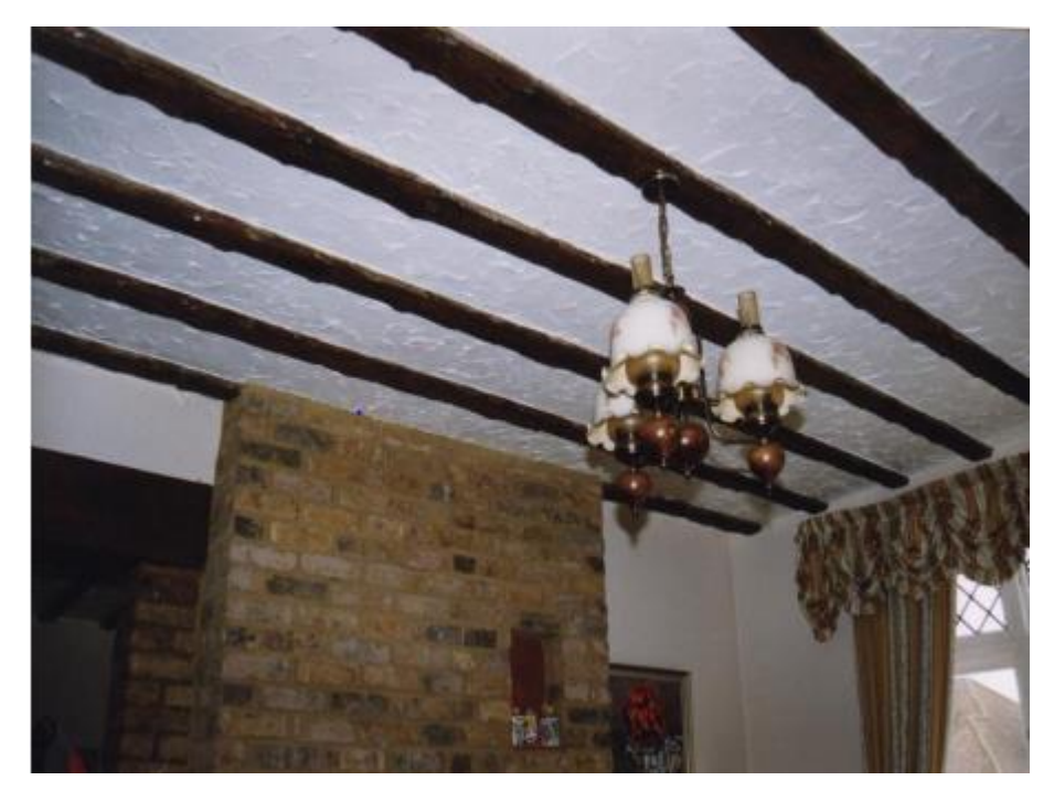
• Certain textured coatings.

• Asbestos cement products, which can be fully or semi-compressed into flat or corrugated sheets. Corrugated sheets are largely used as roofing and wall cladding. Other asbestos cement products include gutters, rainwater pipes and water tanks.