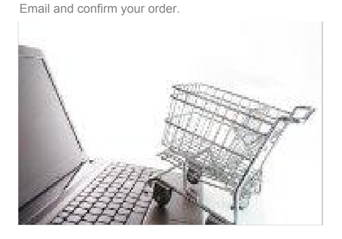
STEP 7: Receive Confirmation of your order and delivery of goods.