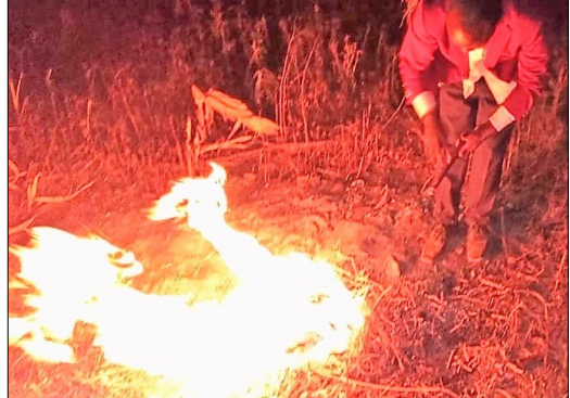
Bryan burning Witchcraft/Sorcery items

from witch doctors, some of them she explained to us that they were used to stop rain from coming or to bring rain during the dry season and every body feared her for doing that in the neighborhood, that she could stop rain or decide when it should rain