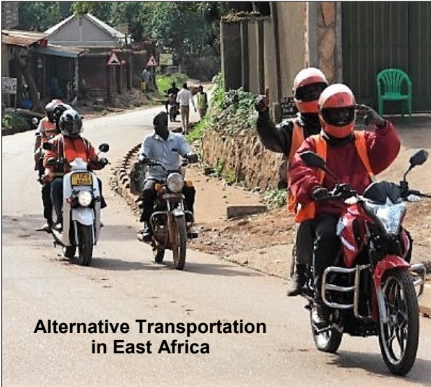
Alternative Transportation in East Africa