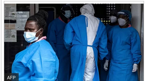
Health workers are at risk from treating Ebola patients

Education Minister Janet Kataha Museveni said on Tuesday that the cabinet had taken the decision to close preschools, primary schools and secondary schools on November 25 because densely packed classrooms were making students highly vulnerable to infection.