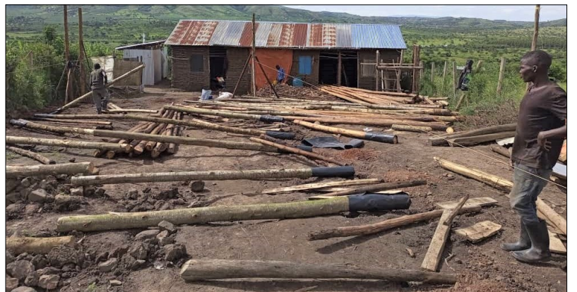
Poles being laid out into position

12 But as many as received Him, to them He gave the right to become children of God, to those who believe in His name, 13 who were born, not of blood, nor of the will of the flesh, nor of the will of a man, but of God.