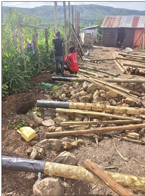
Poles ready to be stood upright