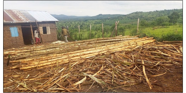
Poles have the bark peeled off of them