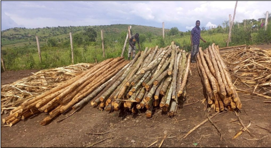
Poles being arranged & prepped