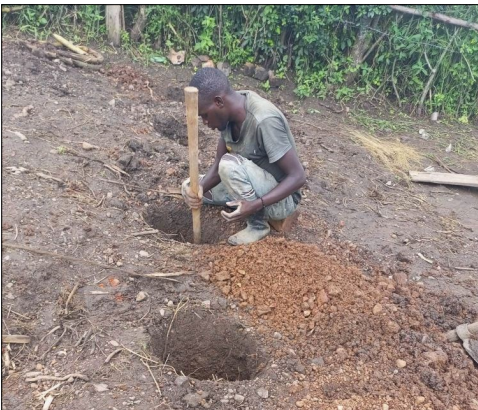
Post holes being measured for depth