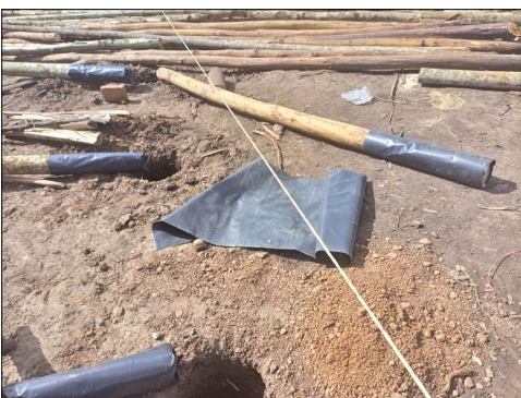
Poles in plastic to prevent Termites