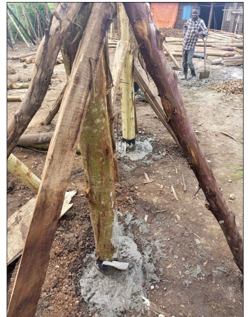
Poles cemented in concrete