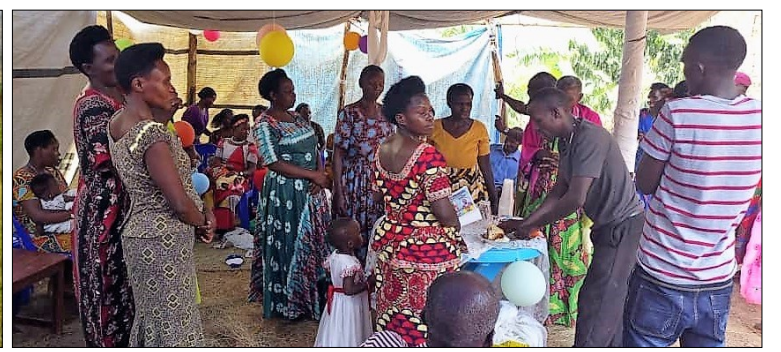
Church Service in one of the New WAY House Churches