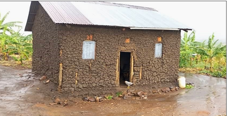
This house is offered to us by one of the member to remove the middle walls and make it a Hall for their prayers.