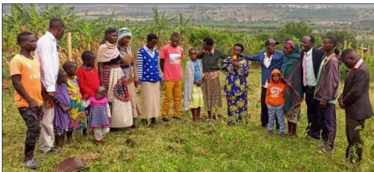
New members of The WAY House Church

Four new WAY House Churches are meeting 3 times a week and being hosted by former prisoners who were part of the Prison Cell Churches who have now been released. The combined attendance of these 4 churches for July has been recorded at 90 people of which 50 of them made a first-time Profession of Faith in Jesus Christ in the last two weeks. Praise God!