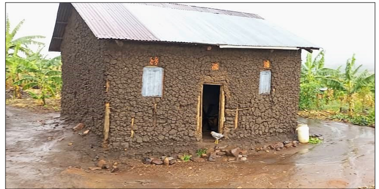
This house is offered to us by one of the member to remove the middle walls and make it a Hall for their prayers.