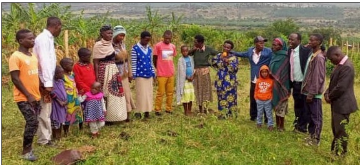
New members of The WAY House Church

Four new WAY House Churches are meeting 3 times a week and being hosted by former prisoners who were part of the Prison Cell Churches who have now been released. The combined attendance of these 4 churches for July has been recorded at 90 people of which 50 of them made a first-time Profession of Faith in Jesus Christ in the last two weeks. Praise God!