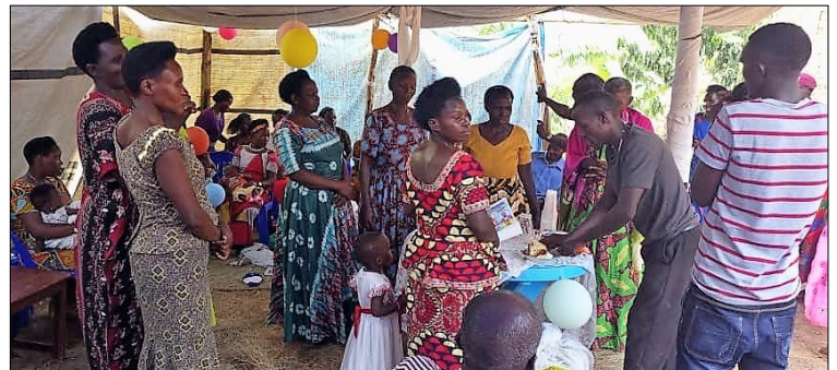
Church Service in one of the New WAY House Churches