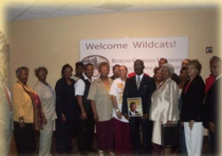
The Board and Staff of Legacy Magazine