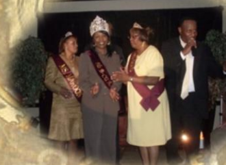
~ Ms. B-CU Alumni and Court ~