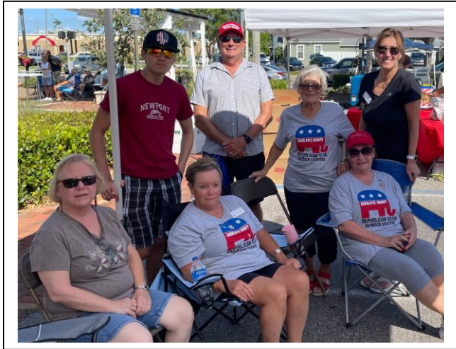
CCRC members enjoying the Downtown Bash on May 27 th . We recruited members, sold bumper stickers and gave out information about the Charlotte County Republican Club.