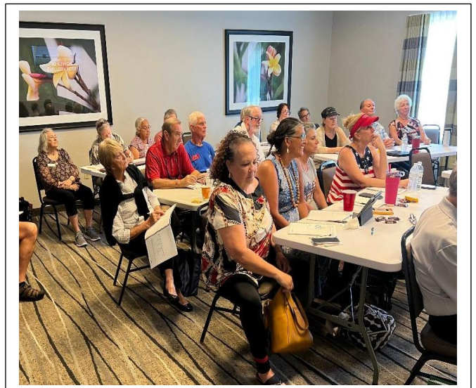
Above: CCRC Members during the Advocacy Training on August 19 th , 2023.

A snarky quote from me, "Socialism in general has a record of FAILURE so blatant that only an intellectual could ignore it". A kinder quote from John Locke, "The visible marks of extraordinary wisdom and power appear so plainly in all the works of creation that a rational creature, who will but seriously reflect on them, cannot miss the discovery of a Deity".