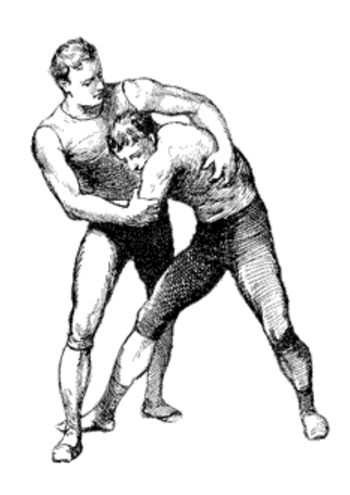
On to the Feats of Strength!