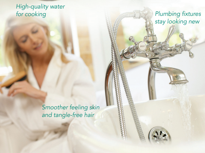
High-quality water for cooking