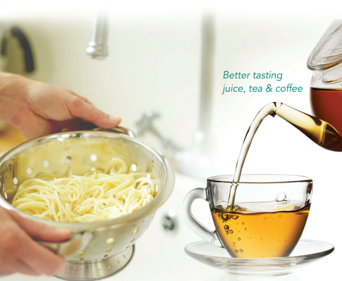
Better tasting juice, tea & coffee

It's only natural to be concerned about the quality of the water that comes into your home. After all, your family drinks it, cooks with it and showers with it. It's used to wash your dishes, bedding and clothes. And if certain impurities aren't removed, water can stain your sinks, showers and tubs, etch your glassware, ruin your clothes, and corrode your plumbing and appliances. Worse still, unconditioned water can also have an unpleasant smell and taste. That's why so many families are turning to an EcoWater whole home system for cleaner, better tasting water.