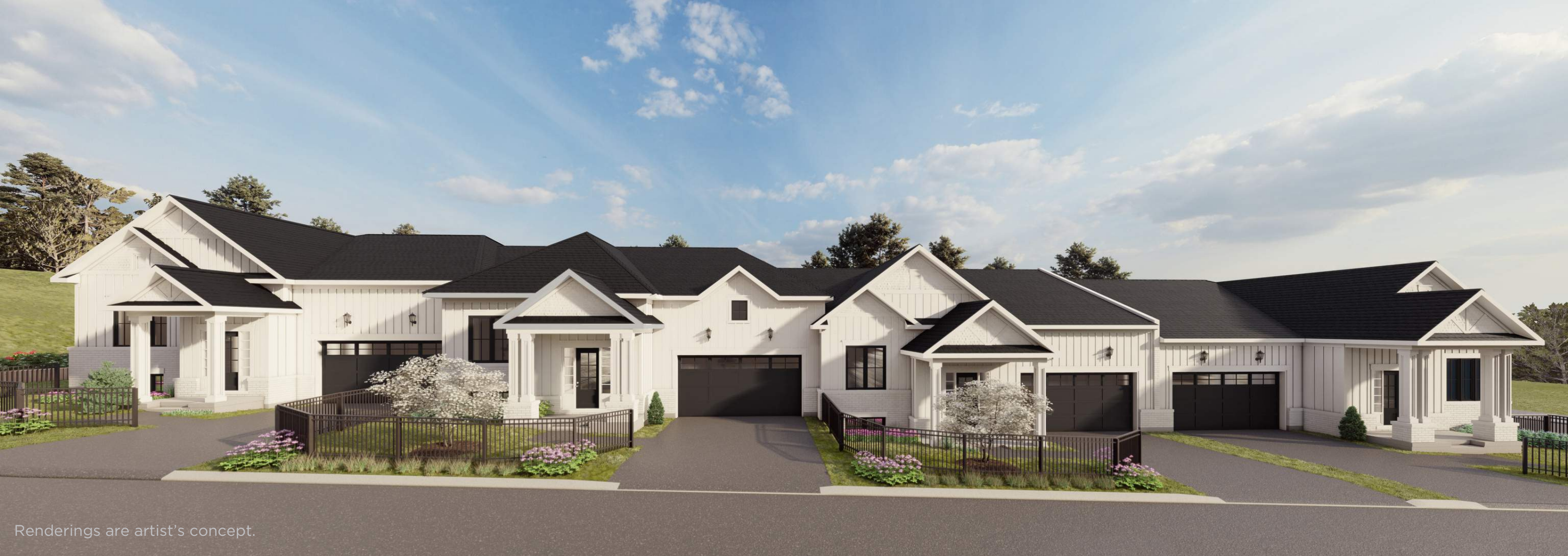
Renderings are artist's concept.