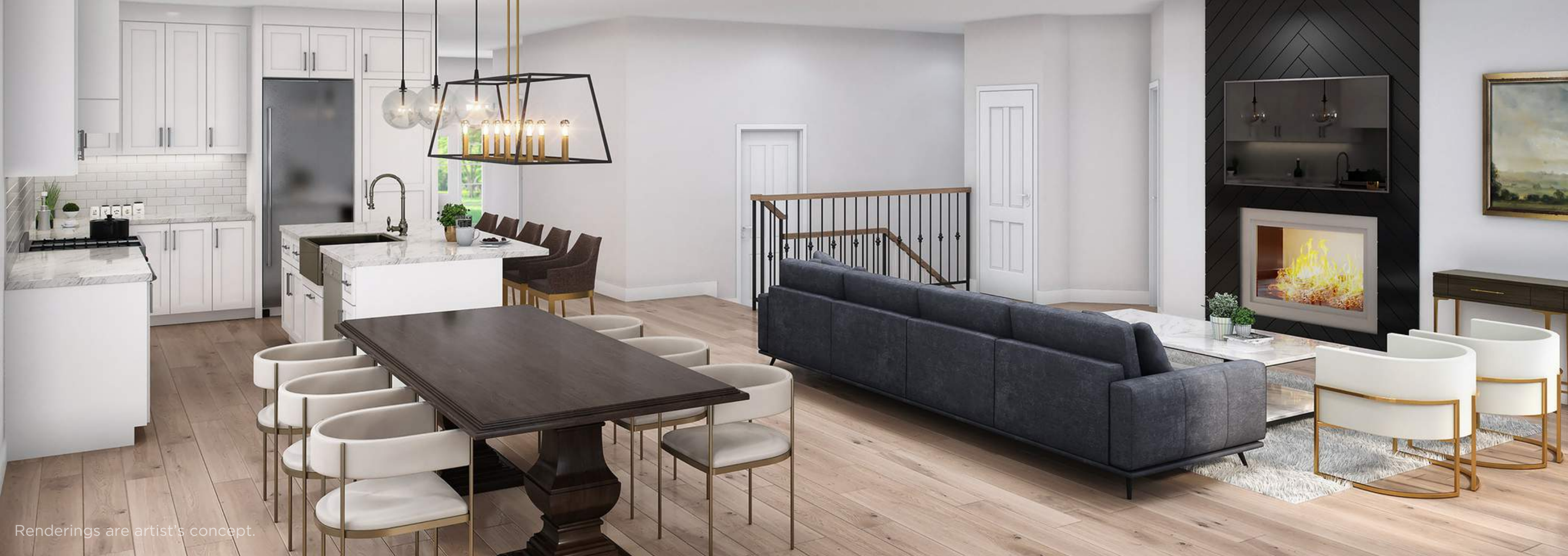
Renderings are artist's concept.