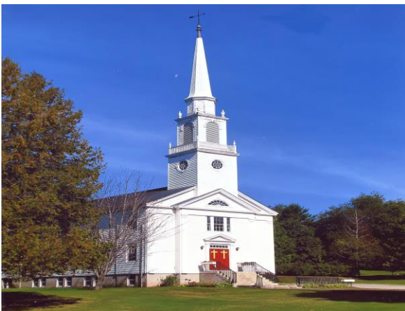
Community Baptist Church, 2016