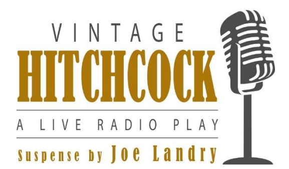
Directed by Jonathan Grafft Run dates: July 9-12 & 16-19, 2020

Cast: 1 male, 4 females. All late 50's to early 60's.